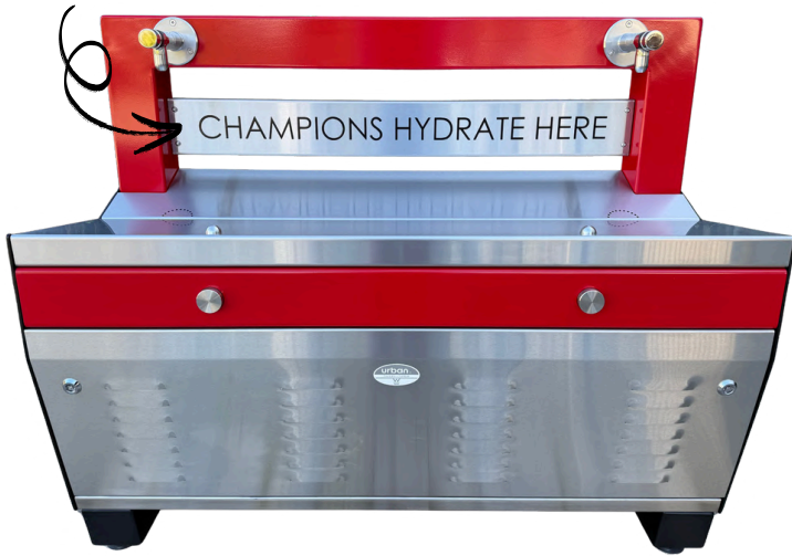
*Standard Acid-etch sign with paint infill